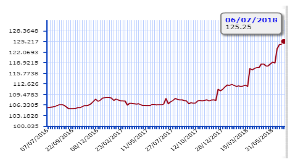
Figure 3 – US Dollar – PKR Valuation Trend